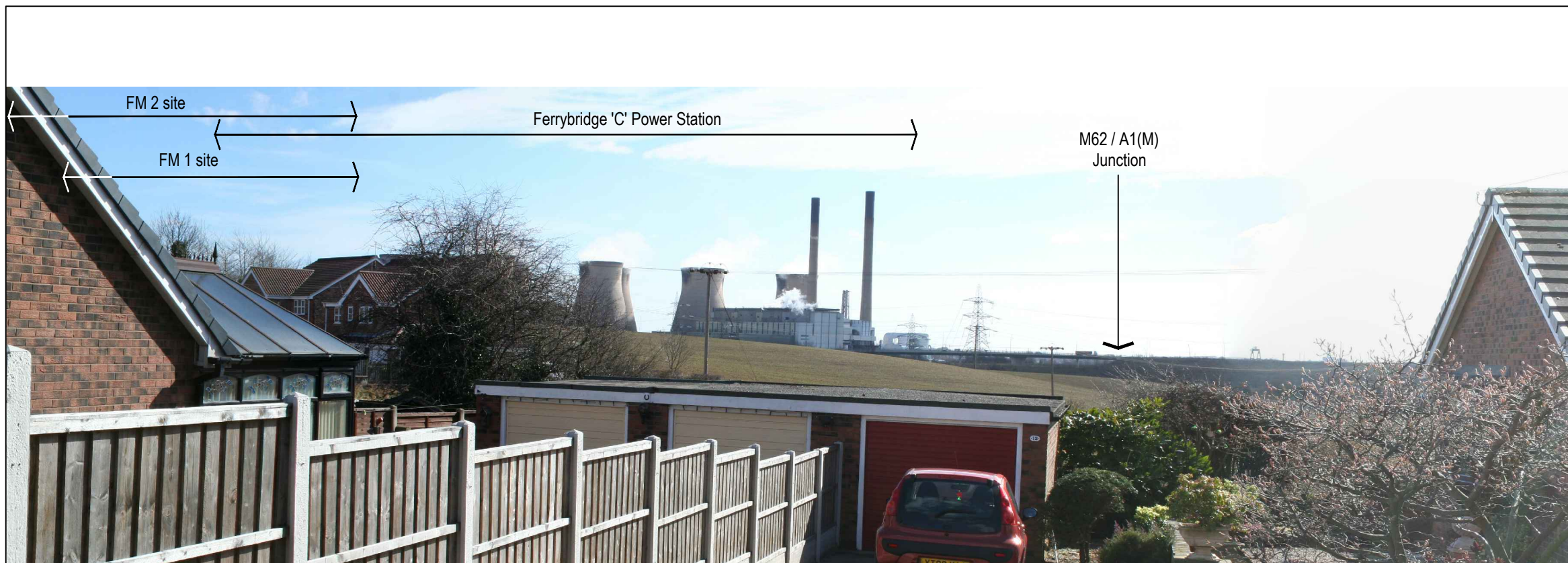
Representative Viewpoint I - Winter view Photographs taken 04.04.2013